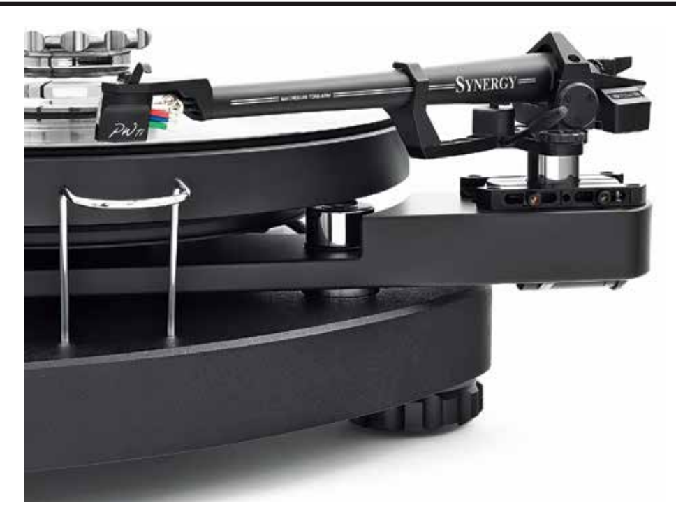
ABOVE: The partnering Synergy tonearm is a sleek version of SME's Series IV. It features the same one-piece die-cast magnesium tube, with improved internal damping and Crystal Cable wiring