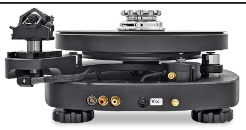
ABOVE: Separate PSU ins are provided for the motor [right] and integral MC phono stage [left], with a line-level output on RCAs. Tonearm wiring is by Crystal Cable with a captive lead to the phono stage. Ground posts are fitted to both motor and chassis

was still closer than fans of the latter might imagine. The result was a taut and funky bass that thundered out of the loudspeakers, making the song riotously good fun.