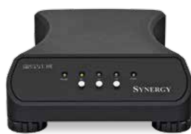
ABOVE: Dedicated outboard PSU offers 33.33, 45 and 78rpm with fine pitch speed adjustment in increments of ±0.01%. Curved case design complements the deck's circular chassis

Another highlight is the excellent soundstaging that made