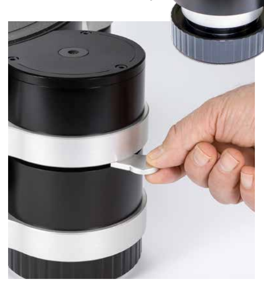
Flat shims provide the correct distance when adjusting the sub-chassis. If they just barely fit, the distance is correct.