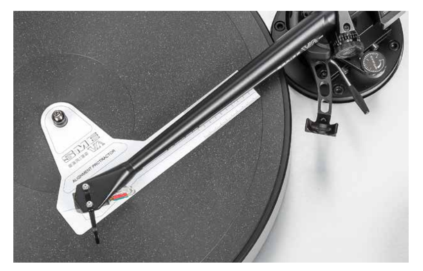
The included template makes adjusting the new Series VA tonearm a breeze – and it is ultra-precise in addition to that.

The shape of the key for adjusting the height of the sub-chassis is reminiscent of SME's model car history.